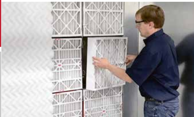
PRIMARY FILTERS GFS Wave® Roll Filter | Panel Filter