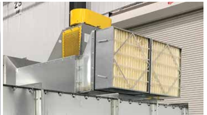
REDUNDANT FILTERS MERV 14 rated